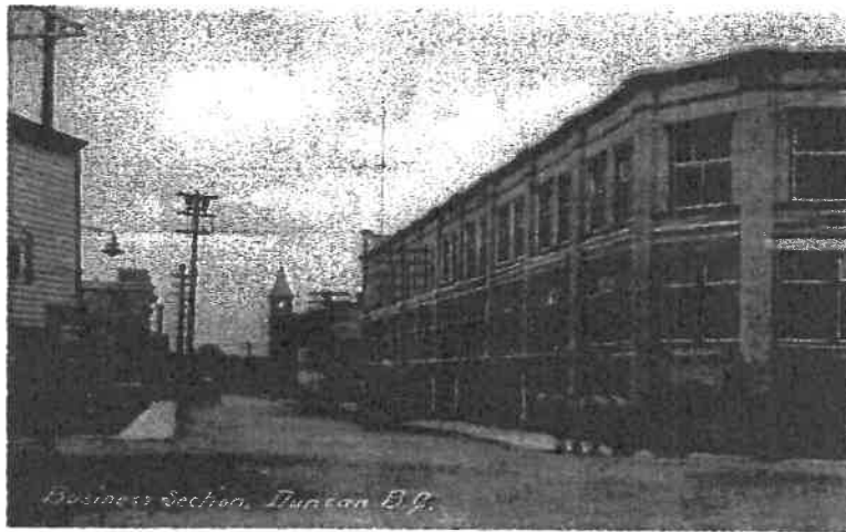
Downtown Duncan 1914

Duncan's farm was named Alderlea , and this was the first name of the settlement. "Duncan" became the official name of the city in 1912.