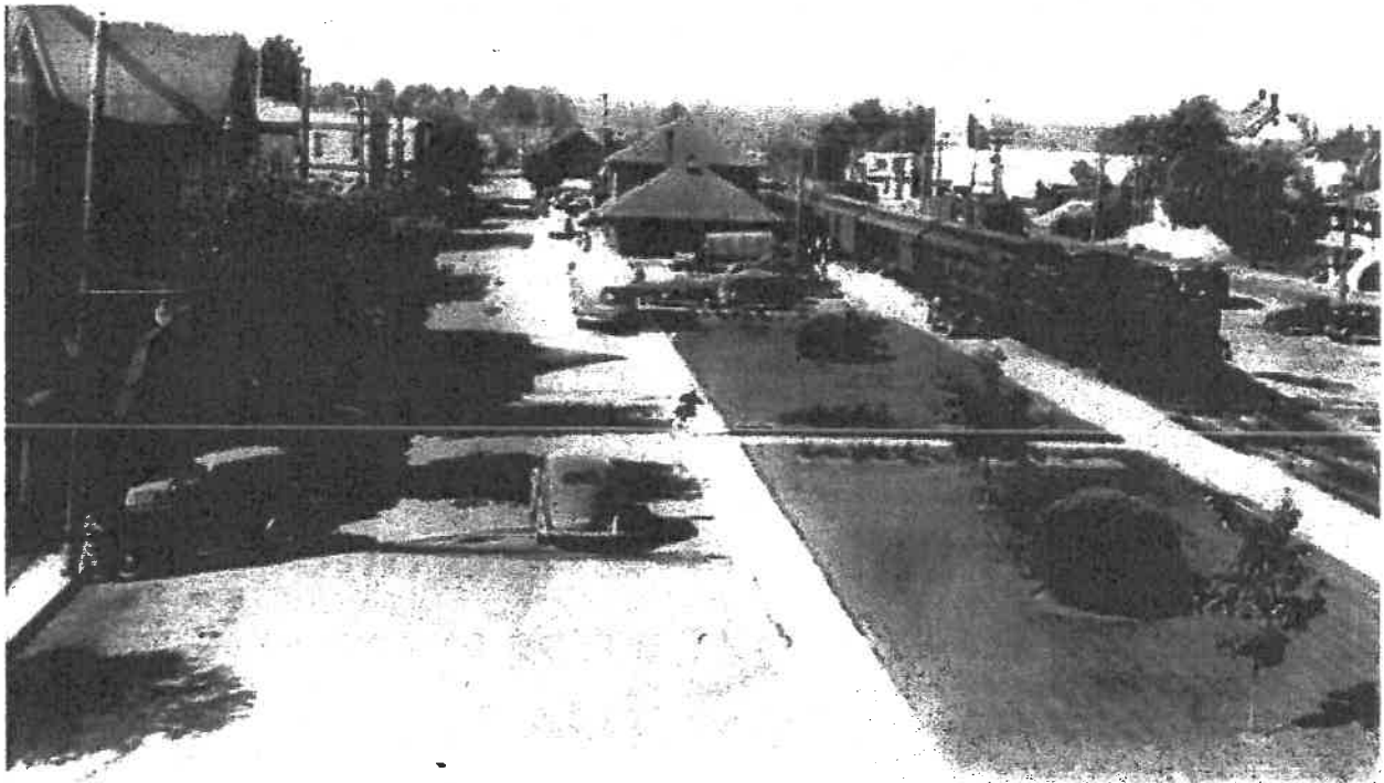
THE RAILWAY STATION DUNCAN B.C